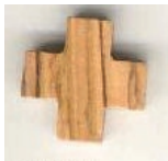
Plain cross (2.5 cm)