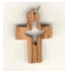
Pack of 5 £7.50