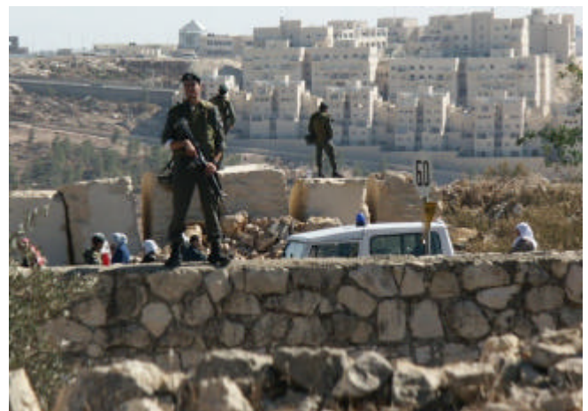
Soldiers on the Hebron Road, towards Bethlehem, preventing people from 'bypassing' the checkpoint