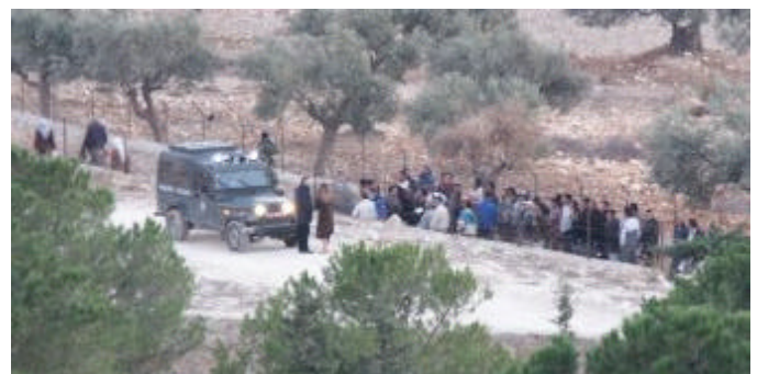
People detained for hours in freezing cold until after dark on a Ramadan Friday

The soldier was unmovable. With a smile on his face, that spoke to me of, perhaps, his discomfort or shame, he continued to explain to her that he “could do nothing.” She begged, finally, in tears,